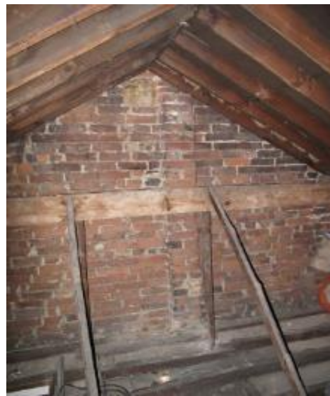
Incomplete party wall (left) and complete (right)

When specifying a loft PIV unit ensure the loft area is not airtight as this will prevent the system from bringing in sufficient fresh external air and working effectively. The presence of daylight is often a good indication of sufficient leakage. Additional ventilation of the roof space may be required in very tight roofs e.g. voids with tightly fitted breather membranes.